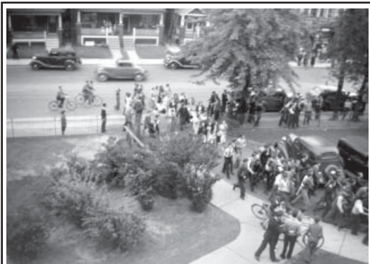
Principal Walter Graham drove up and down Gerrard Street, attempting to persuade the many celebrating students to return to class.

The following day in the auditorium, the striking students were reprimanded by Principal Graham who pointed to a brass plate on the rear auditorium door which spelled