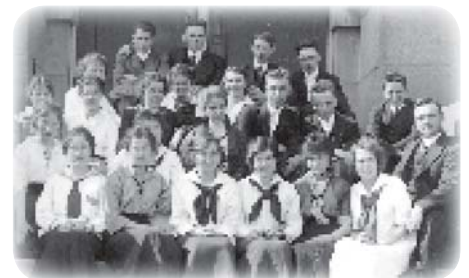
R.C.I. Staff & Students, 1915