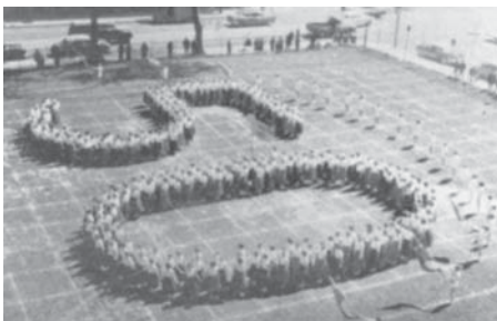
50th Jubilee Anniversary May Day, 1957

Please submit your pictures, stories and anecdotes by this date for Centennial Booklet.