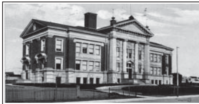
Riverdale Collegiate, 1912

Our best wishes are with you as you plan for and organize for Riverdale's 100th Anniversary!