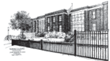
Does this look familiar?

And finally, much interest in creating a CD is being expressed.